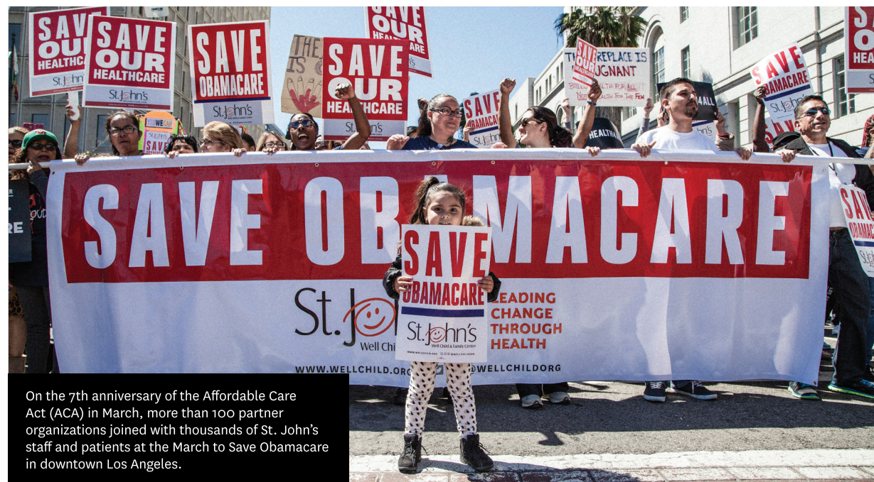
On the 7th anniversary of the Affordable Care Act (ACA) in March, more than 100 partner organizations joined with thousands of St. John's staff and patients at the March to Save Obamacare in downtown Los Angeles.