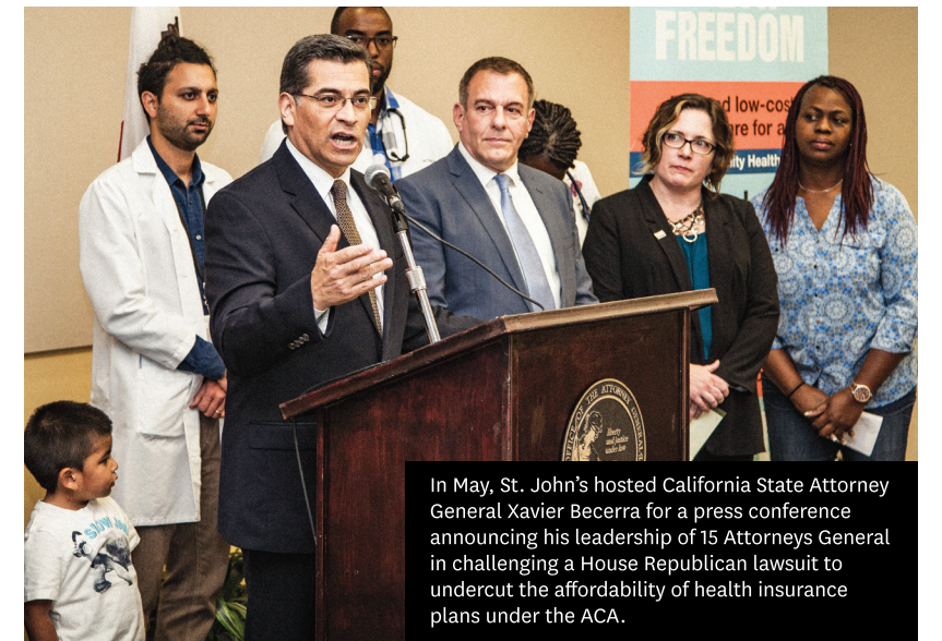
In May, St. John's hosted California State Attorney General Xavier Becerra for a press conference announcing his leadership of 15 Attorneys General in challenging a House Republican lawsuit to undercut the affordability of health insurance plans under the ACA.